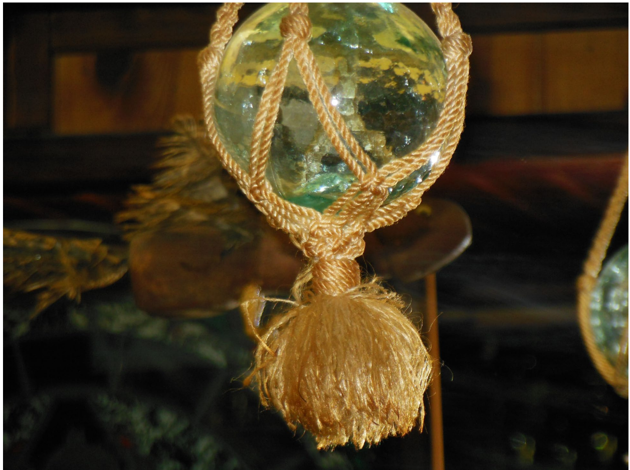
The "Dickie Bird"