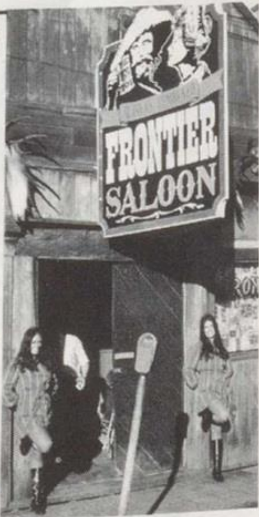
Alaska Travel Guide – 1973