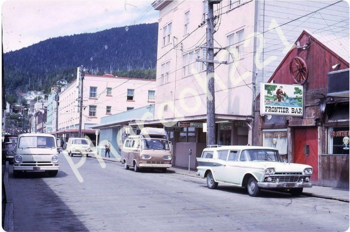
Exterior of the Frontier - 1960's