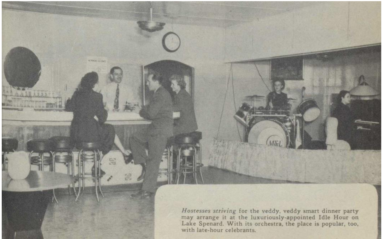
Hostesses striving for the veddy, veddy smart dinner party may arrange it at the luxuriously-appointed Idle Hour on Lake Spenard. With its orchestra, the place is popular, too, with late-hour celebrants.