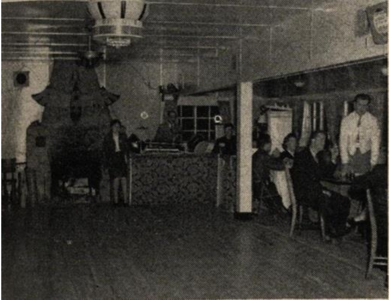
From Alaska Life magazine – March 1945