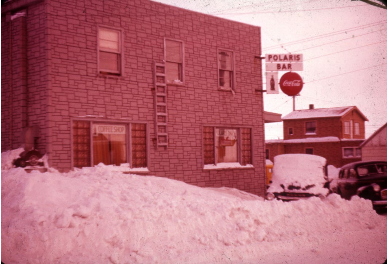
Polaris Bar circa 1960