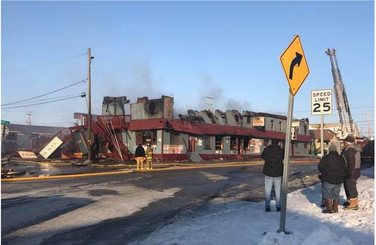
October 31, 2017