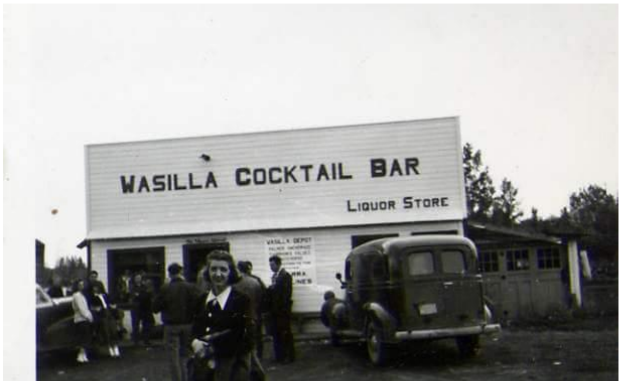
These photos were taken at the first location, across the street from Teeland's Grocery.