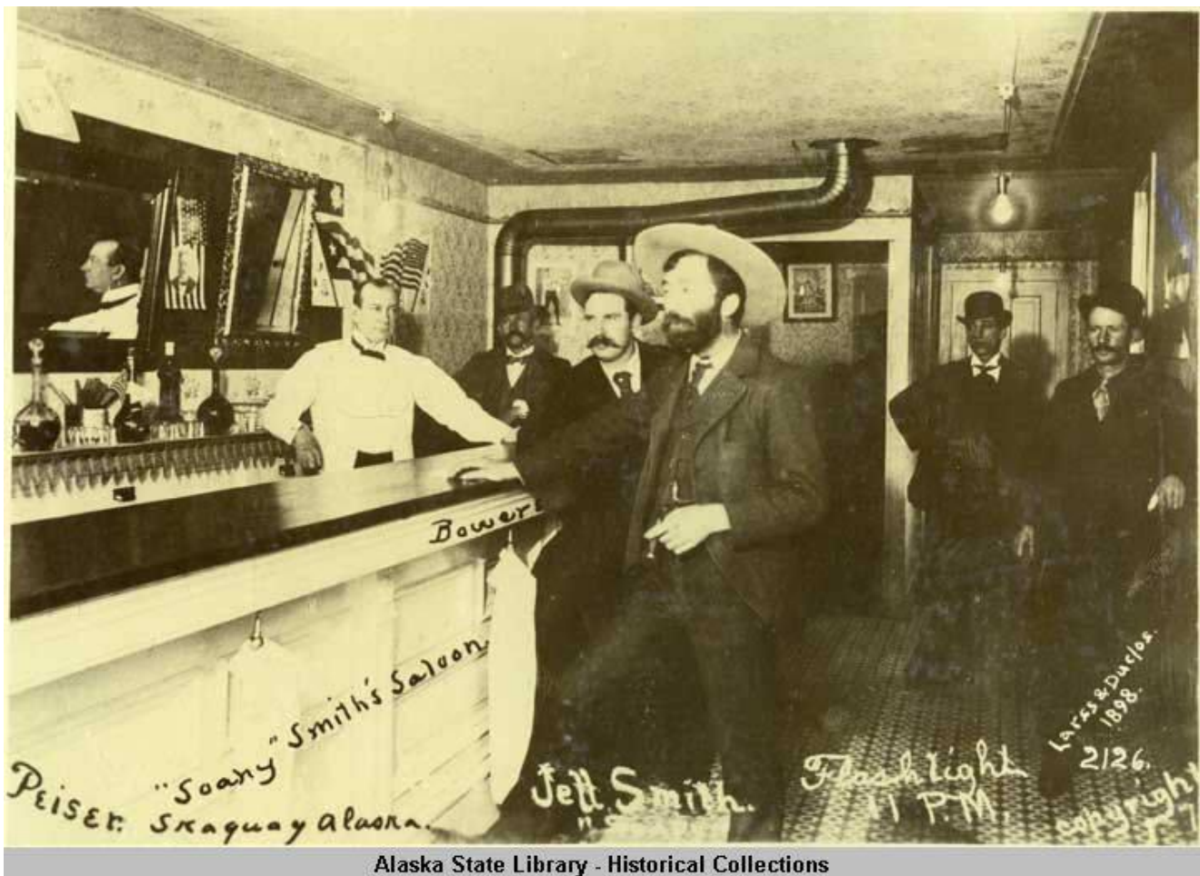
Alaska State Library - Historical Collections