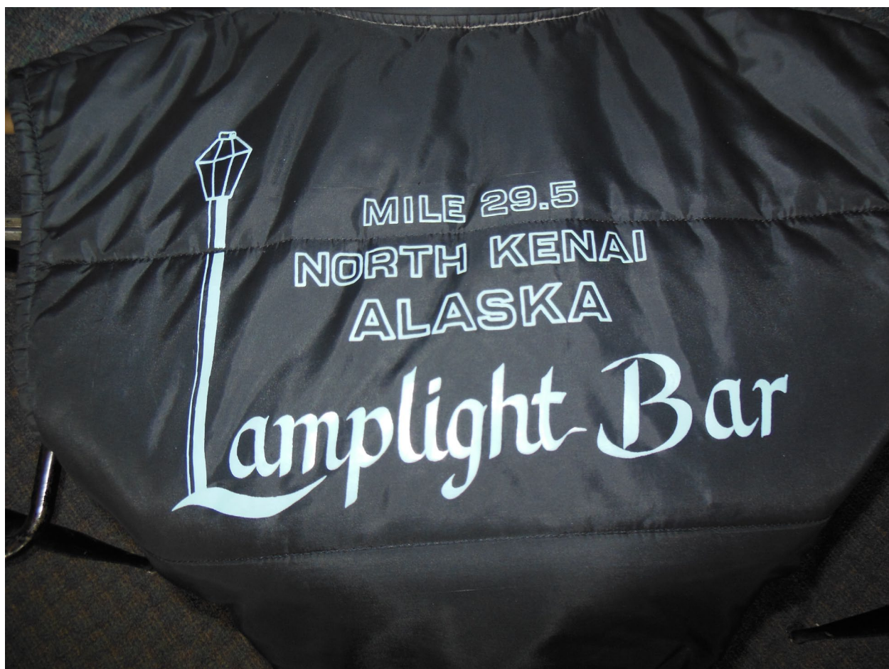
Lamplight Bar jacket.