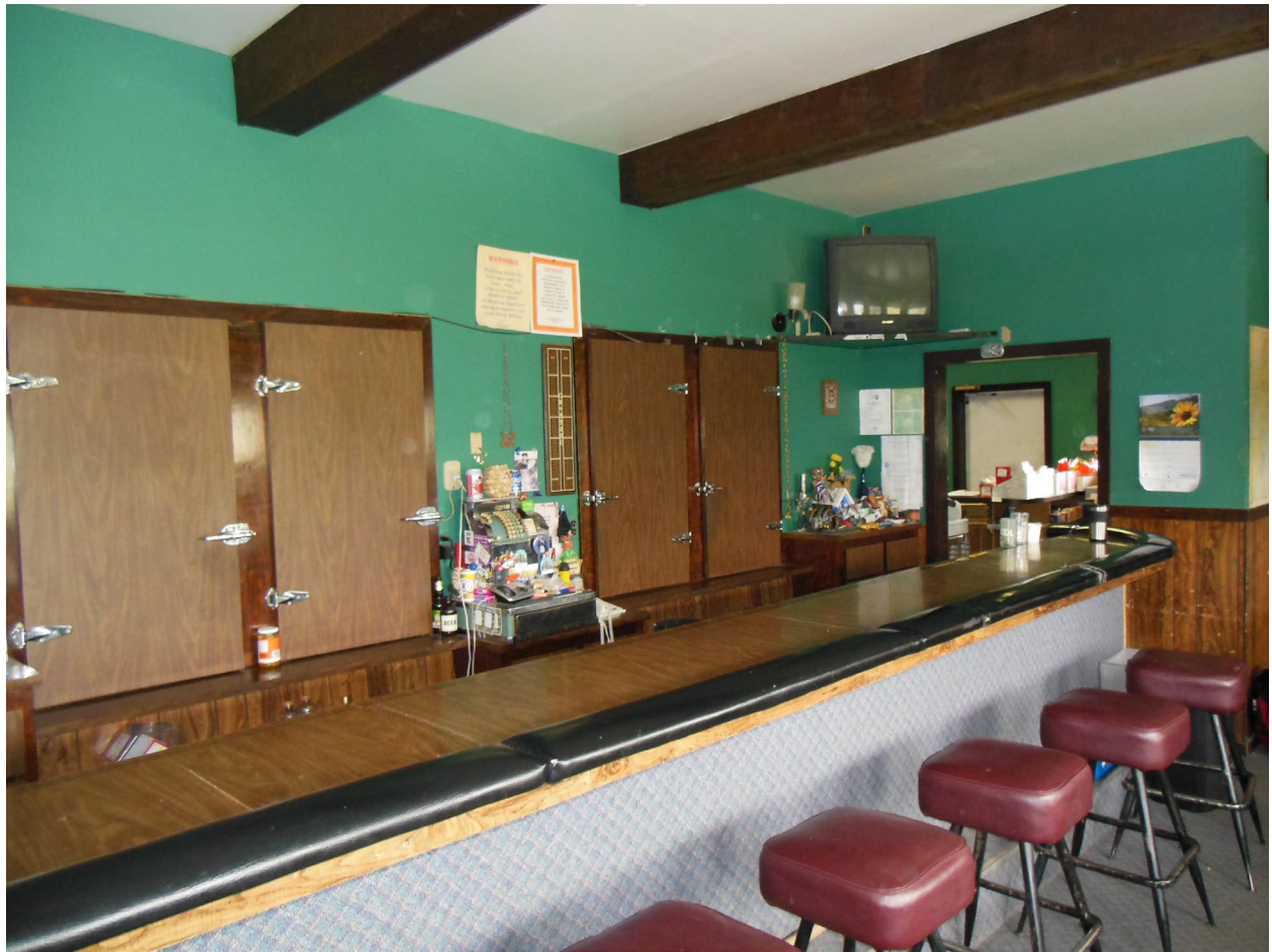
Interior of the Lamplight Bar – 09/01/2012